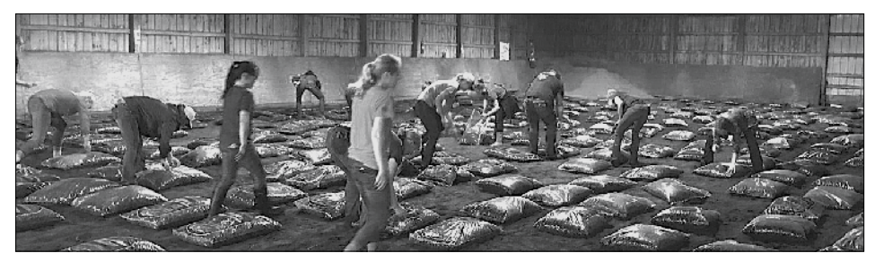
Cedarville University students spreading new rubber footing around the indoor arena.

Thank you to all who give so much! You are truly appreciated!