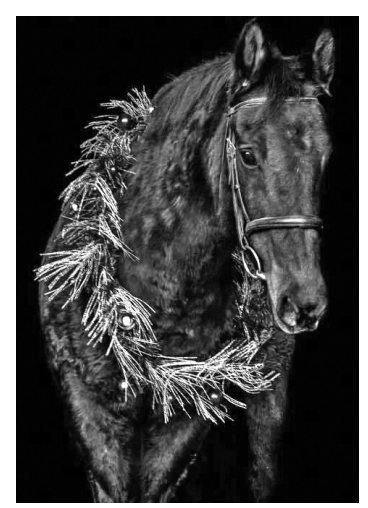
A healthy Lenny poses for a Christmas portrait.

diately laid out a plan for Lenny's return from the hospital. He would have to be kept from contact with the other horses for six weeks. That would not be too hard, since he would be on stall rest for several weeks anyway. It was decided that one person would take over his care during that time. Since salmonella can be transmitted through contact with manure and urine, the person would have to be fastidious about hand washing, sanitizing areas, and using designated tools, wheelbarrows, and shoes only in Lenny's stall. Sounds familiar now, right? We even set up a grassy area with yellow caution tape where only Lenny could be hand-grazed when the