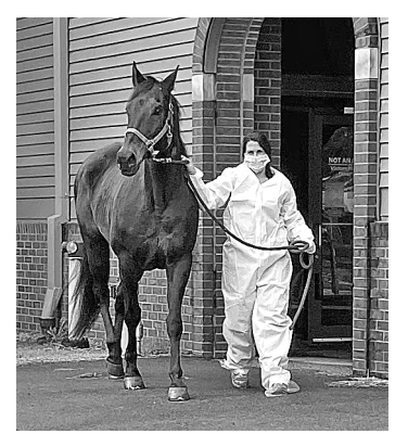
Lenny leaves OSU Equine Hospital after recovering from surgery.