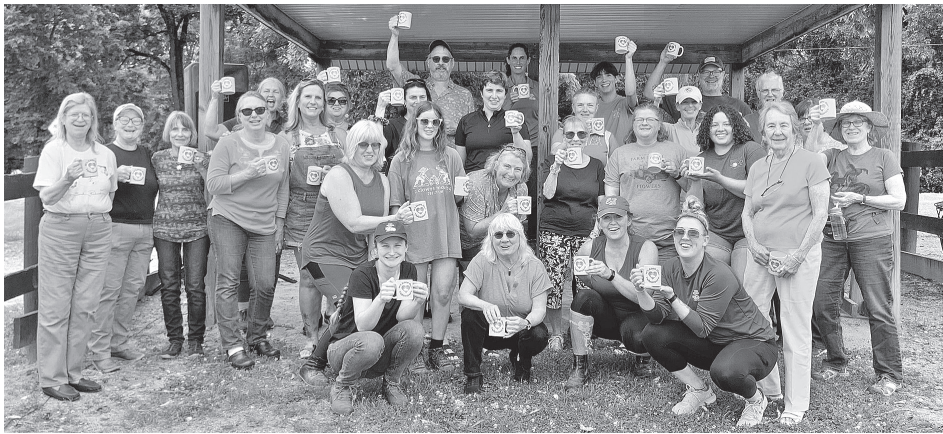
We love our volunteers!